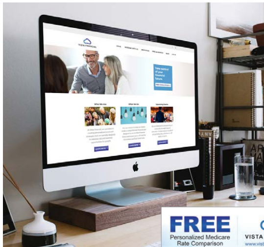
Custom Website Design