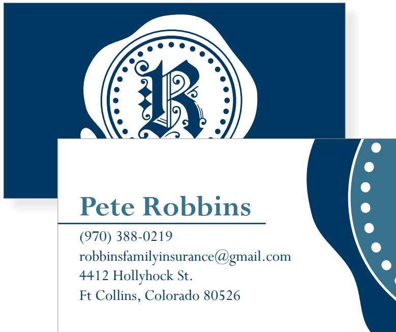
Business Card (Top: Front, Bottom: Back)

One of our newer projects, Robbins Family Insurance requested a complete identity overhaul. This project included a custom logo, business card, stationary and future website production.