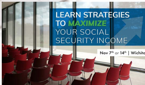
Facebook Event Promo