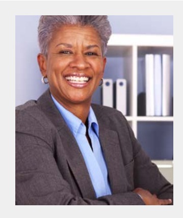
MEDICARE ADVANTAGE (PART C)

Medigap (also known as Medicare Supplement) refers to the various private health insurance plans sold to supplement Medicare.