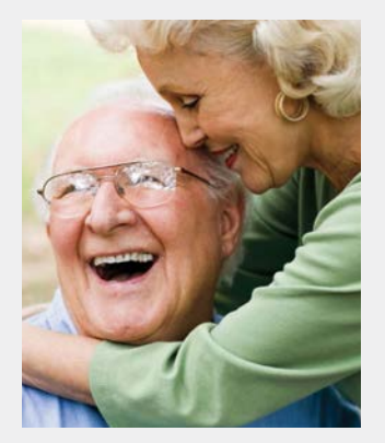
FINAL EXPENSE /LIFE

Important addition to original Medicare part A and B.